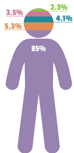
Demographics of all Kirkwood Students (480,948)

Native American or Alaska Native Asian Hispanic or Latino Black or African American White